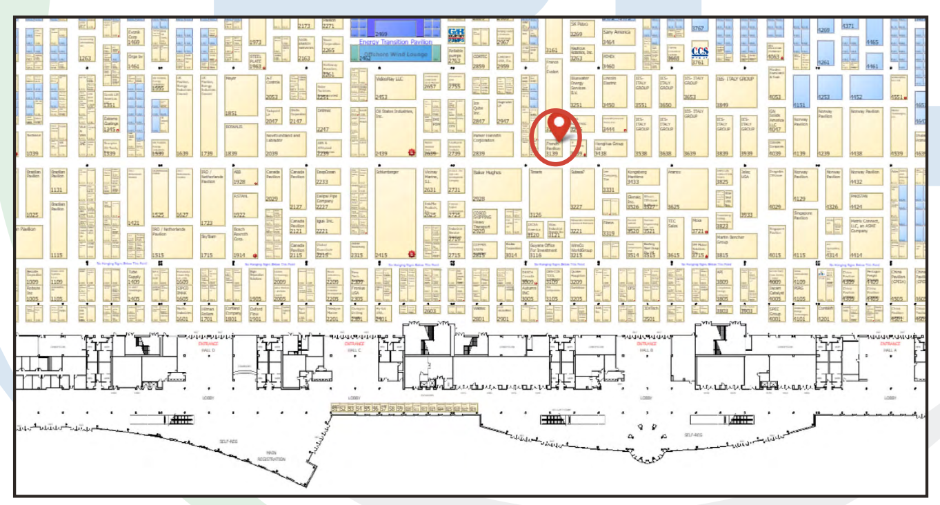
OTC 2023 Floorplan - 3C Metal's location indicated in red.

For the fifth year running, 3C Metal will have a promotional stand at the exhibition's French Pavilion located in Hall B, booth 3139. A team of dedicated 3C Metal employees will be on site every day to answer questions and promote 3C Metal's services.